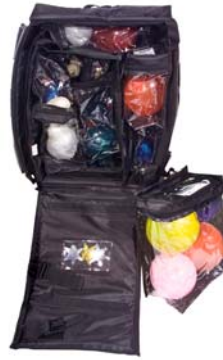
Stor-Mor end access when closed