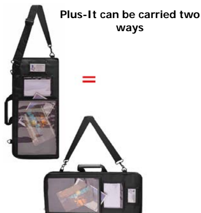
Plus-It can be carried two ways